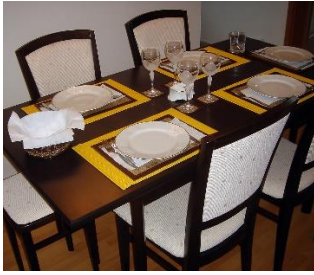
Sean Ryan Pub

The Ladies Luncheon, Wednesday, January 29, 2025 will be held at Sean Ryan Pub, 2019 14 th Avenue, Vero Beach, 32960 at 12:00 noon.